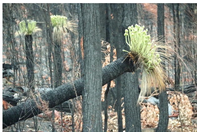
Grass-tree regrowth after bushfire Manjimup Road - 14th March 2015